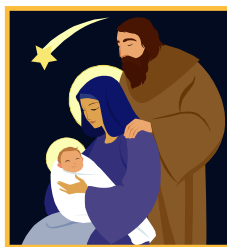
We are all called to have Holy Families.

“...the Church ought to apply herself to understanding the situations within which marriage and the family are lived today, “